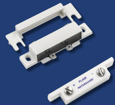
1000-H2O: Water Sensor, Terminals

Water leaks are a common problem in care facilities. Our leak sensors can be integrated into all of our call systems.