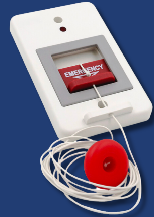
EPC500W: Wireless Pull Cord Station

Our base nurse call systems are not dependent on Wi-Fi computer connectivity and work even when the power goes out to ensure care givers can always take care of their residents. They are easy to customize to any facility with a variety of sizes and call devices such as pull cords, pendants, push buttons, fall pads, etc. Our flexible designs mean you can add on features as the future demands. Pagers, iPhones, and other displays are easy to integrate. Our systems can also be connected to Wi-Fi enabling metrics and reports to be available from any browser.